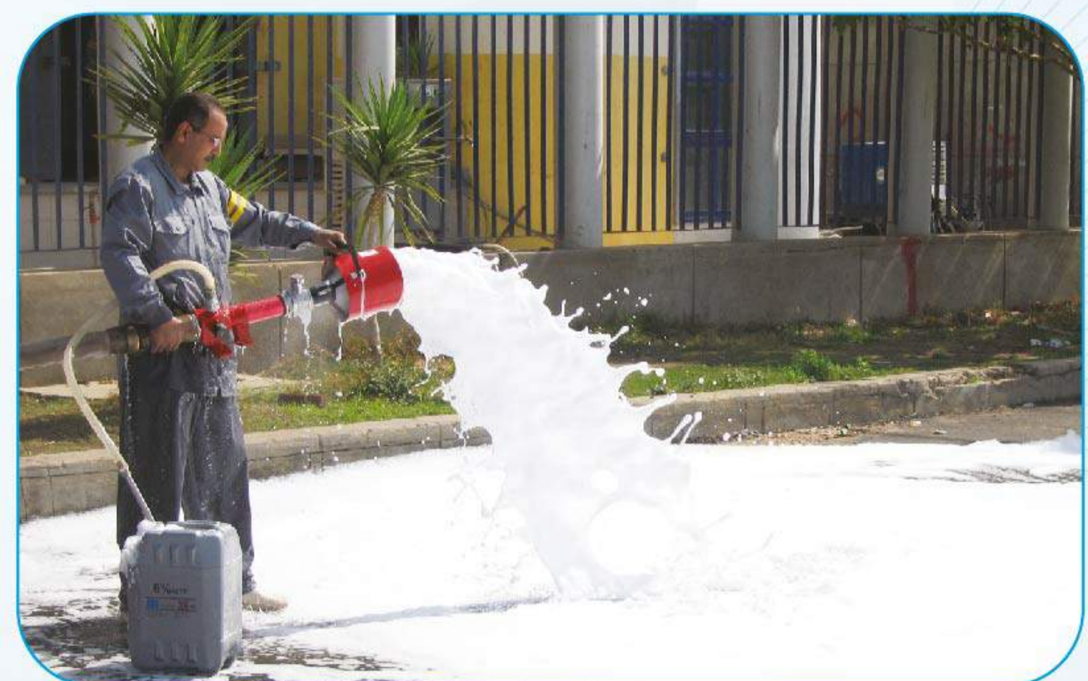
Medium Expansion Nozzles