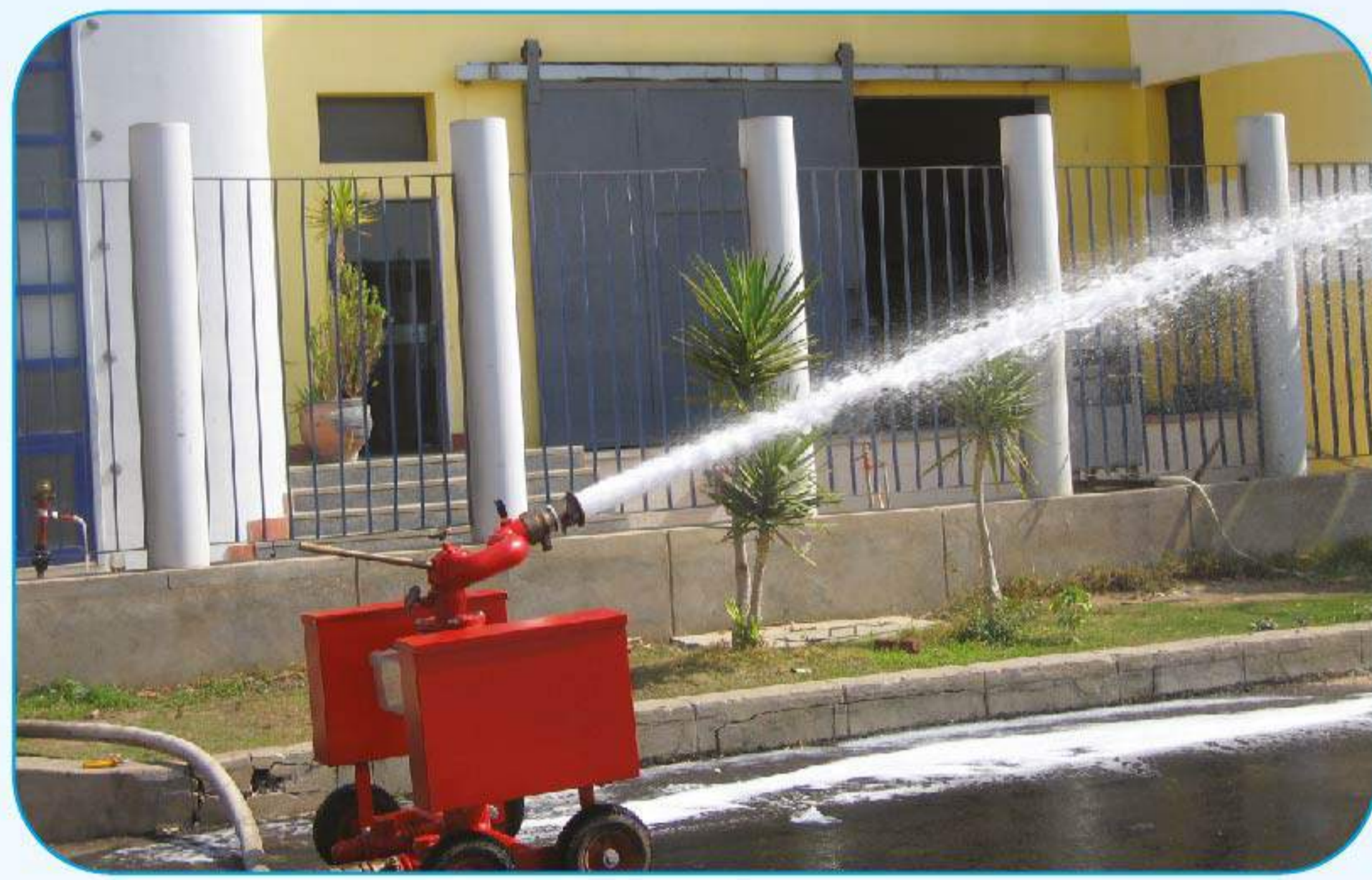
Automatic Oscilating Mobile Monitor