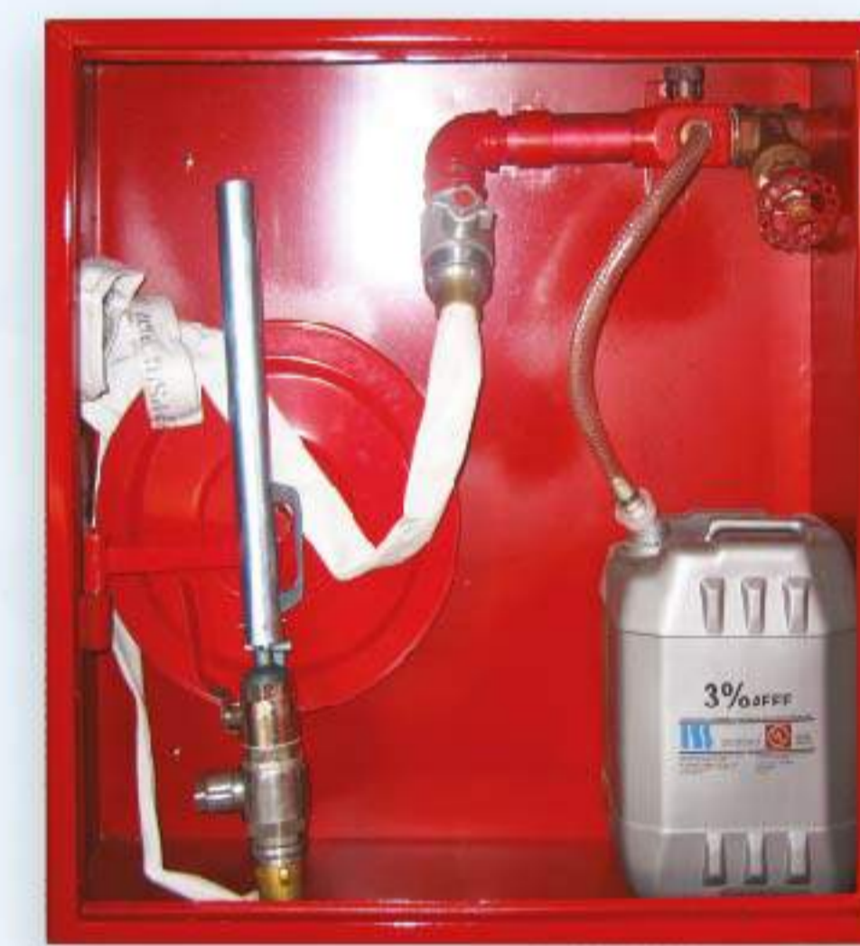
Foam Hose Cabinets