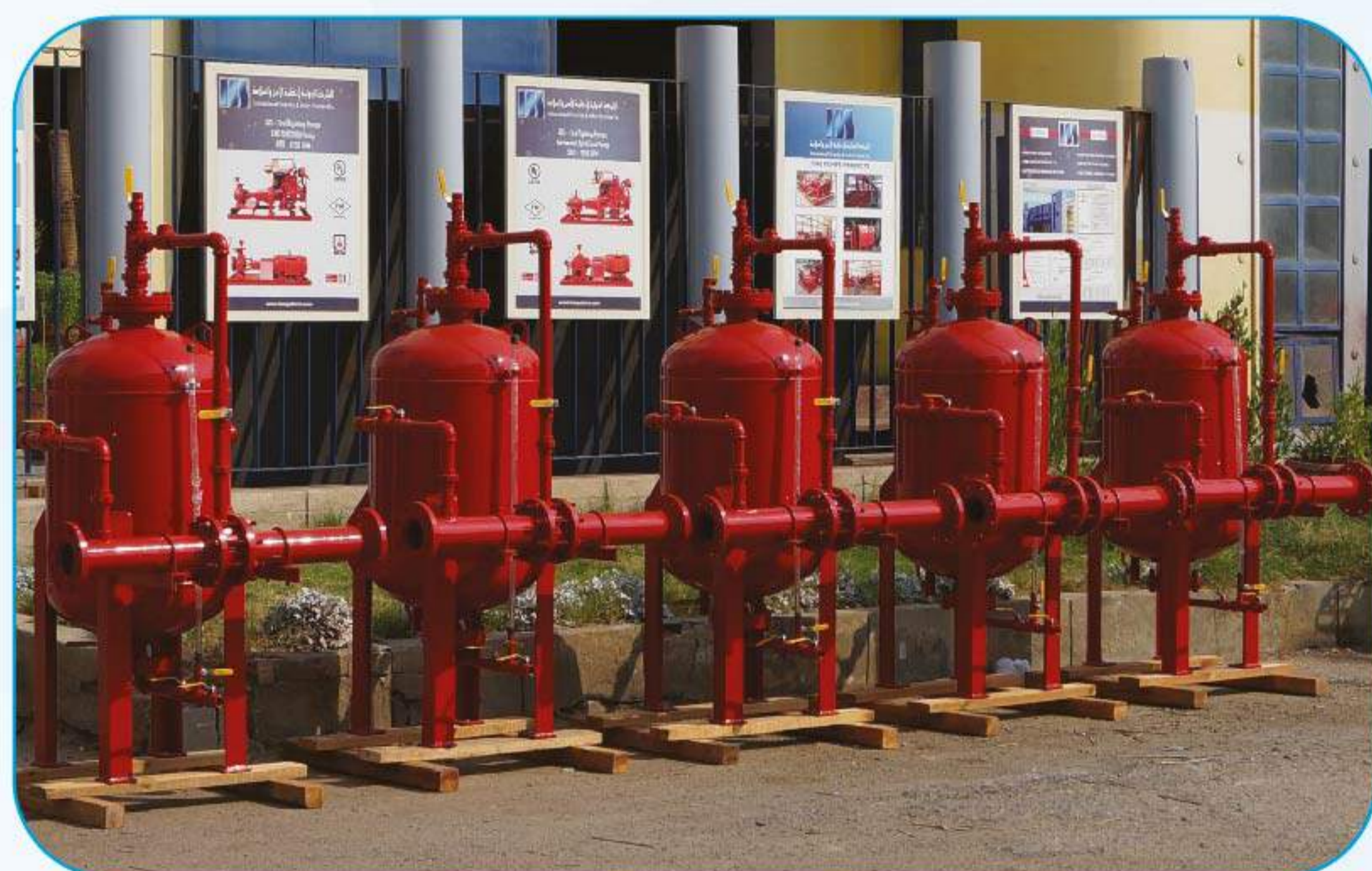
Bladder Tanks Shipment