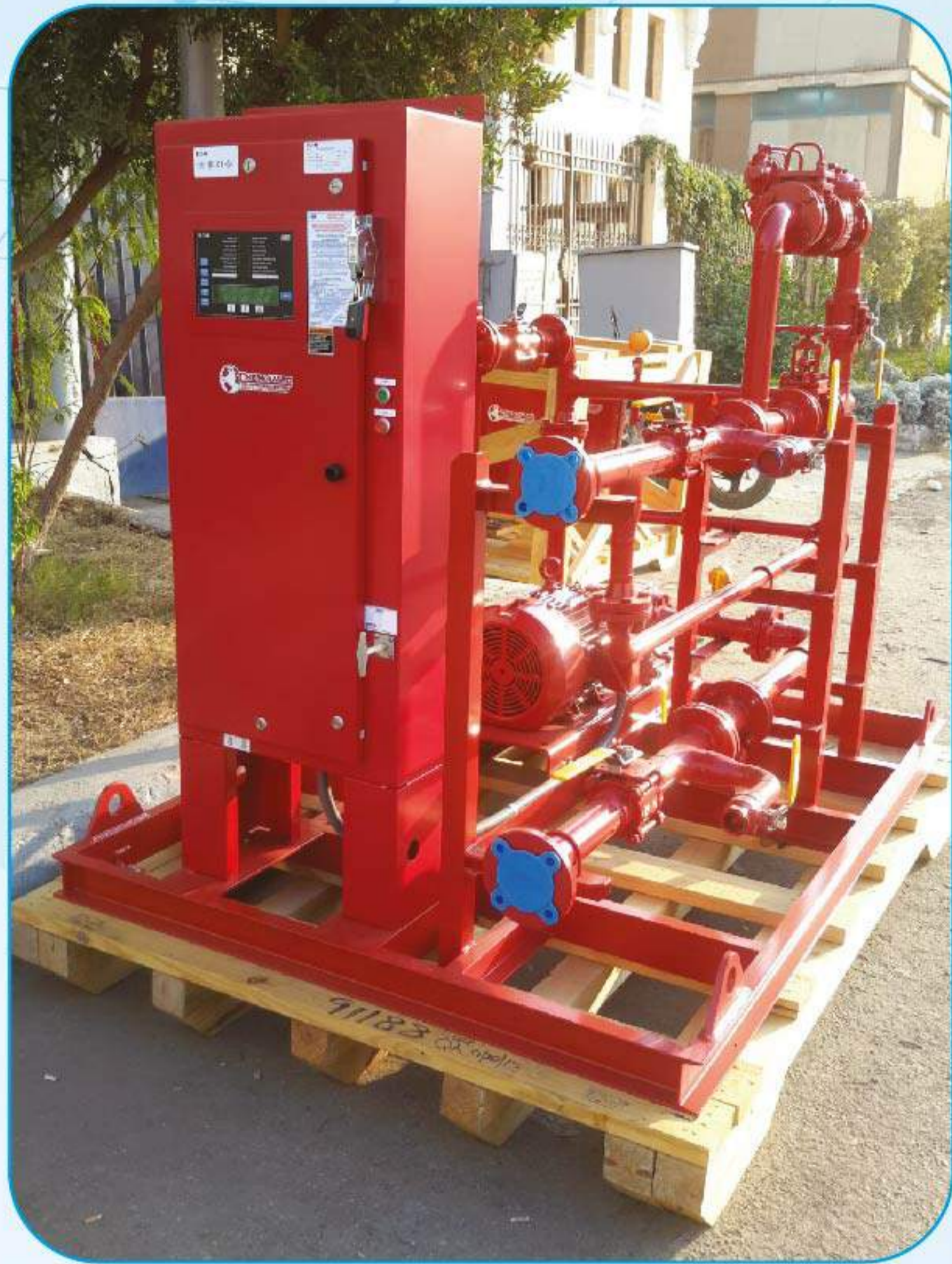
Foam Pump Skids