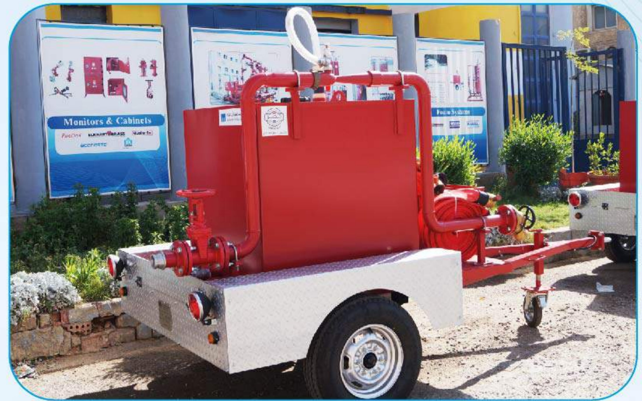
Custom made foam trailers Foam