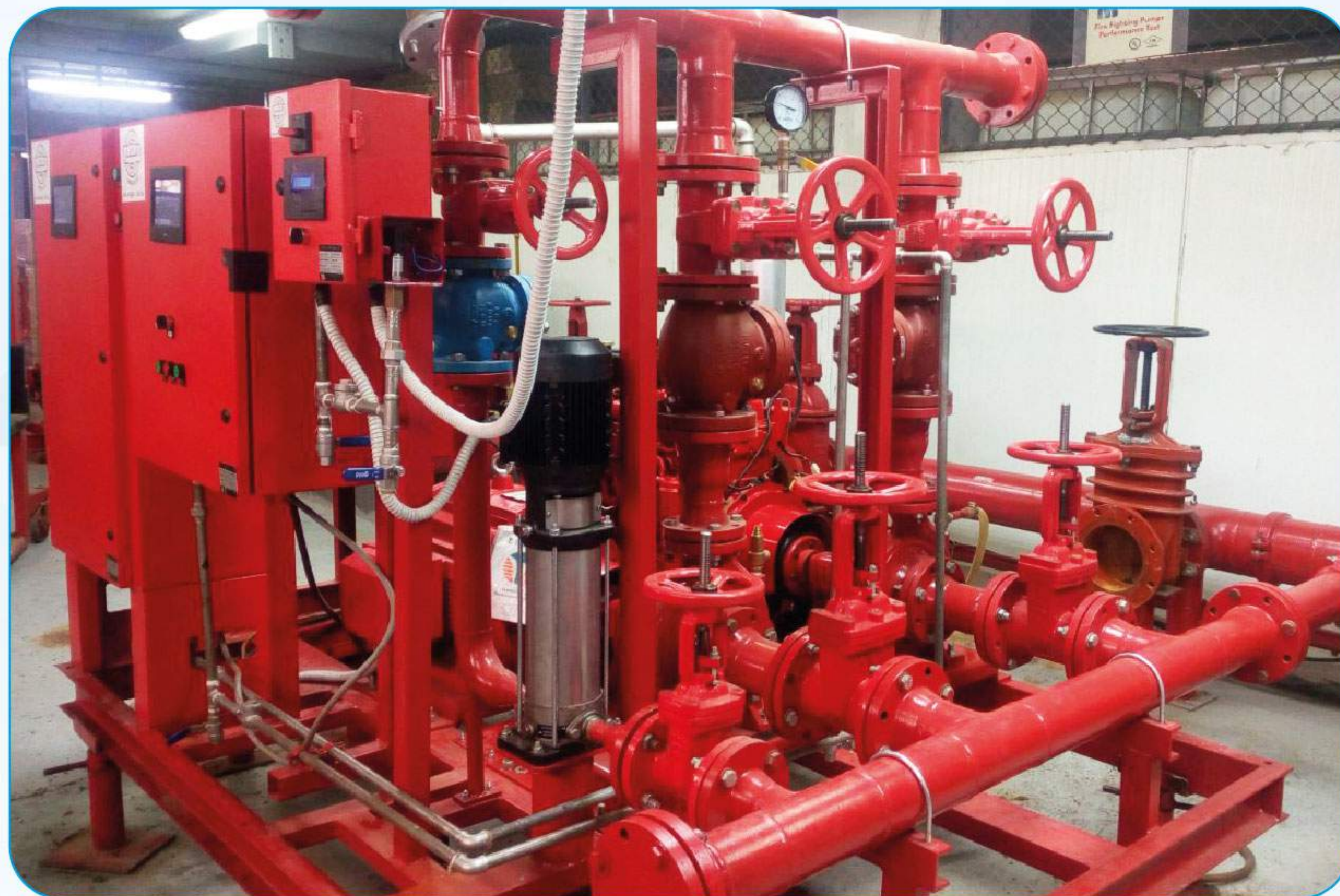
CE Packaged Fire Pumps - 100 - 5000 gpm.

Above picture is for a 500 gpm - 8 bar packed pumps - tested at factory and delivered to a project in AFRICA